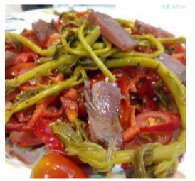
Tomato with Bonito 9,80 €