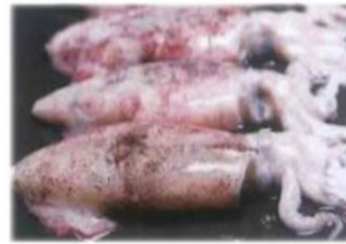
Domestic squid Price according to market