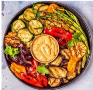
Grilled vegetables 8,90€