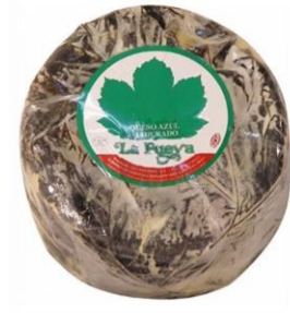
Blue cheese leaf 7,00 €