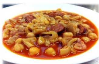
Tripe stew 7,00 €