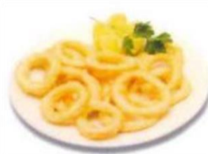
Calamars a la romana 9,80 €