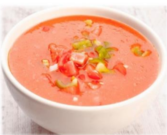
Gazpacho 4,00 €