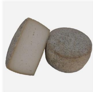
Manchego cheese 6,00