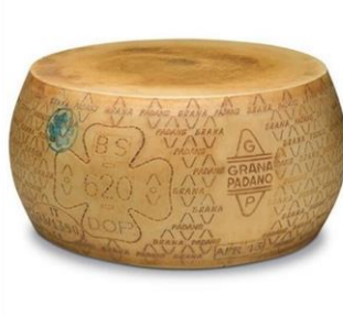
Parmesan cheese 7,00 €