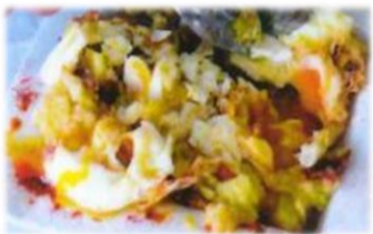
Starry eggs 8,90 €