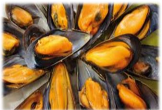
Mussels 7,00 €