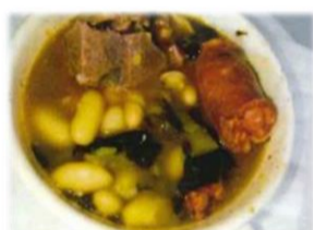
Mountain stew 7,00 €