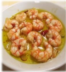
Garlic shrimp 12,00 €