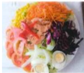
Mixed Salad 6,50 €