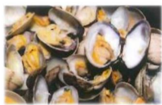
Clams Cockles 12,00 €