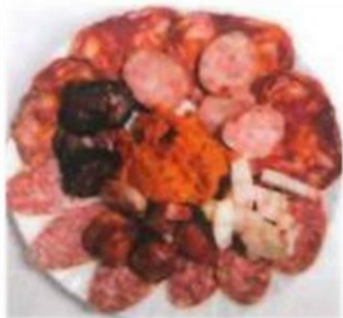
Sausage plat 8,90 €