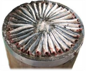
Anchovies in brine 2,50 €