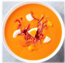
Salmorejo cup 4,50 €