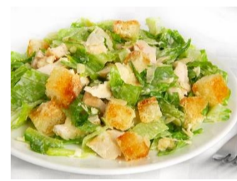
Caesar Salad 9,80 €