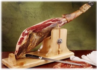
Bodega Ham 8,90 € Iberian ham 14,00 €