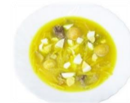
Covered Soup 6,00 €