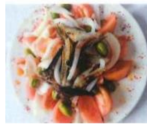
Chaplain Salad 6,50 €