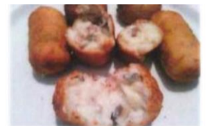
Homemade croquettes 1,00 €